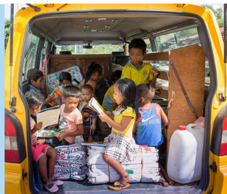
M'lop Tapang, mobile library, Sihanoukville, Cambodia