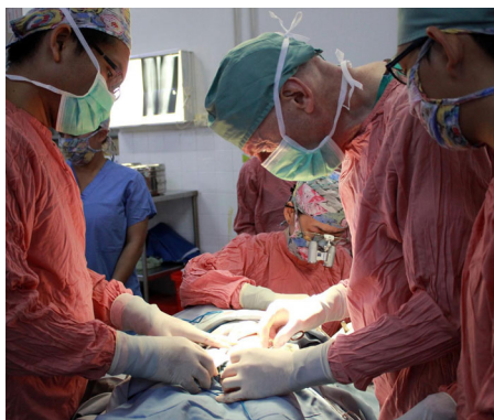
Children's Surgical Centre, Phnom Penh, Cambodia

Funding continues to assist a student, hoping to become a teacher, from a poor district in the Philippines to enable her to complete her schooling and then become effective in furthering education to poor students in her area. We receive regular letters and progress reports and this modest grant clearly is accurately targetted.