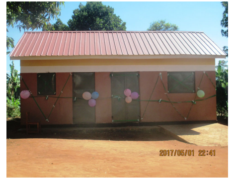
Completed kitchen at Walukuba West Primary School, Jinja, Uganda

Divine Mercy Primary School has increased in number of enrolments from 33 last term to 50 pupils this term, 32 girls and 18 boys.